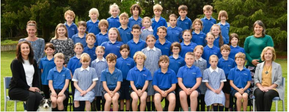
Omarama School 2024.